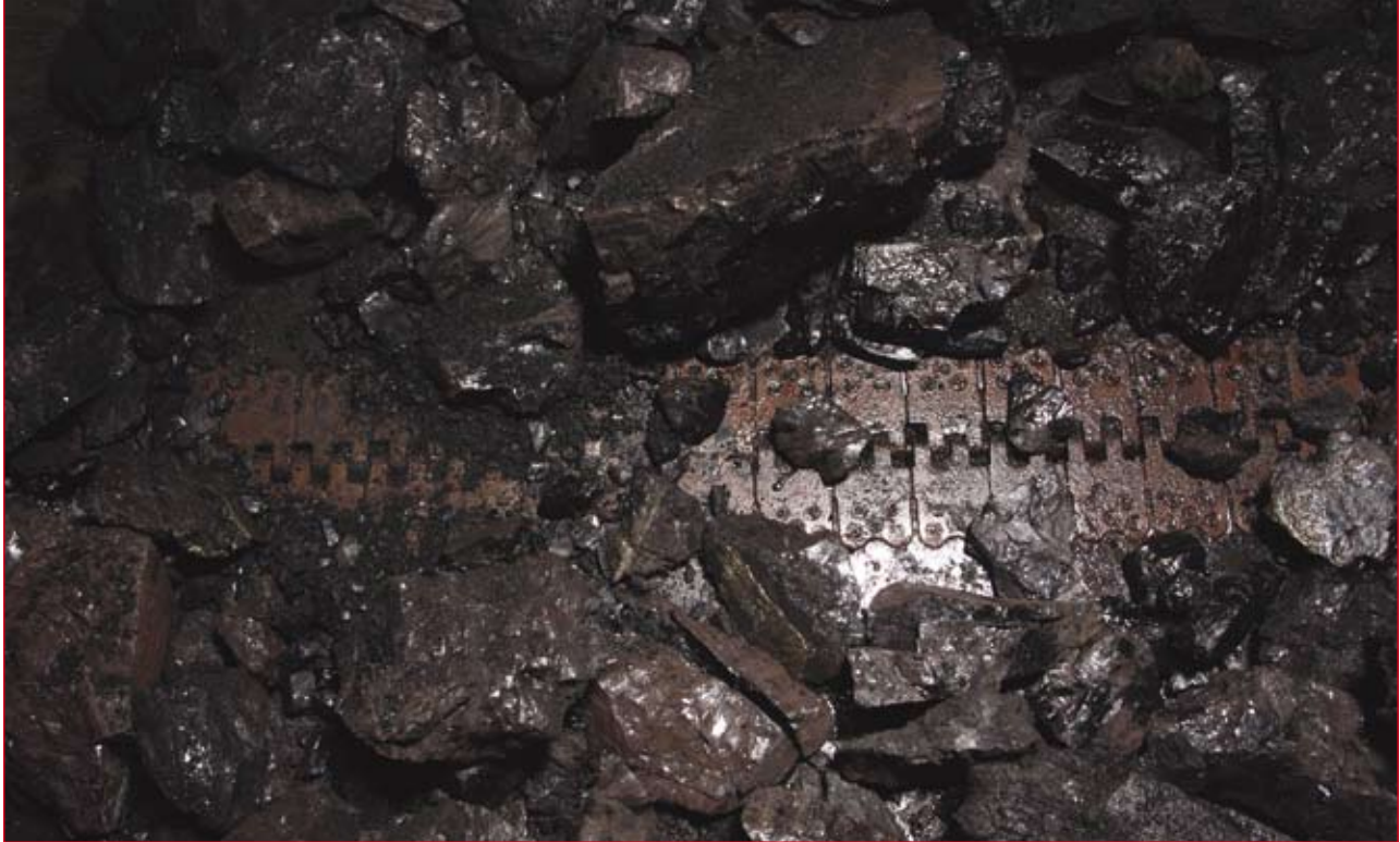
Hinged fasteners can easily be separated by removing the hinge pin - essential in mining operations where belts are frequently removed.

the most common misconceptions include the following.