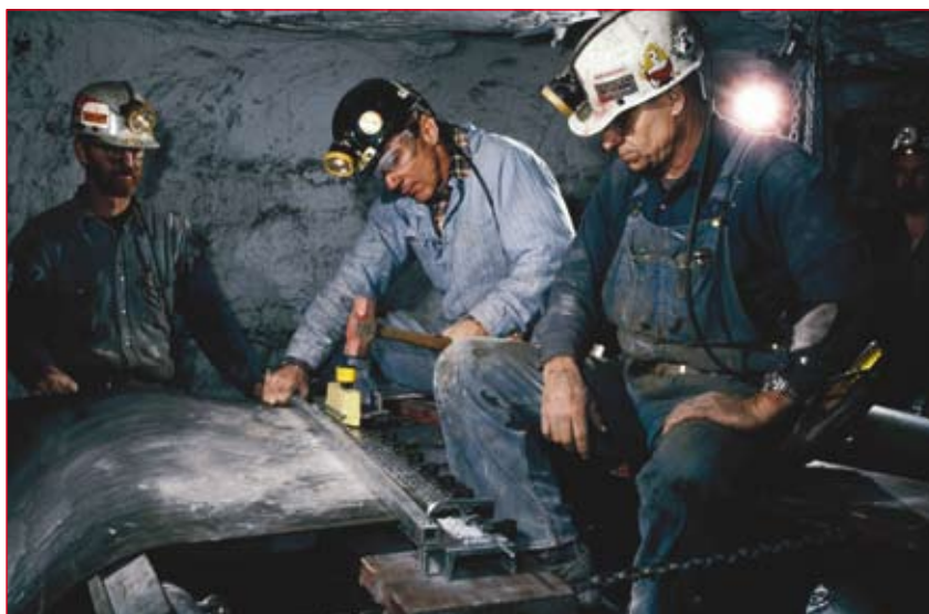
A mechanical splice can usually be installed in less than 60 minutes.

For mining applications, rivet hinged fasteners allow for the greatest versatility. Rivet hinged fasteners combine top and bottom fastener plates, which are joined at one end by two wide hinge loops. Each pair of plates