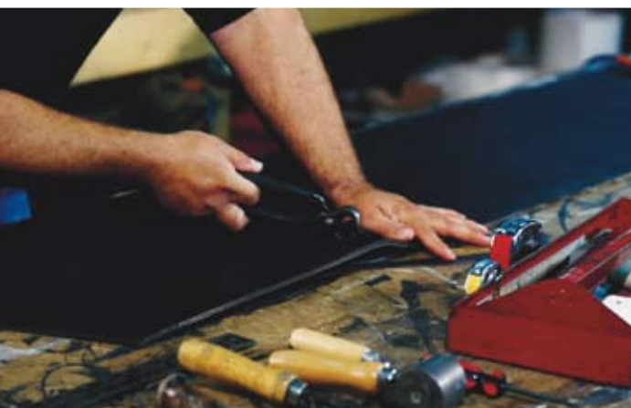
The vulcanisation process requires a skilled expert, specialised tools and a clean, moisture-free work environment.

questions to ask when choosing between mechanical fastening and vulcanisation.